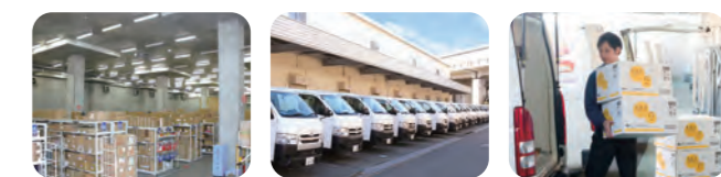
柏物流センター Kashiwa logistics center | 日野倉庫 Hino warehouse | 配送風景 Scene of delivery