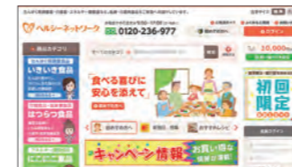
オンラインショップ Online Store