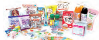
エネルギー・たんぱく質・カルシウム・鉄・亜鉛補給食品等 Nutrient fortified foods