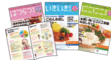
通信販売カタログ Mail-order catalog