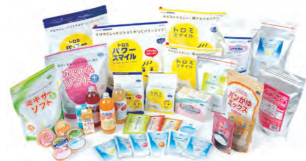
とろみ調整食品・固形化補助食品・やわらか食品・水分補給ゼリー Thickening agents, jellifying agents, soft foods, thickened beverages

嚥下障害のある方や、低栄養の方向けの商品など、特徴のある食品でも「おいしさ」にこだわり、商品を召し上がるお客さまはもちろん、ご家族や商品を提供する方など、全ての方に安心・満足していただける商品を目指し、衛生・品質管理にも徹底的に取り組んでいます。商品は販売代理店を通じて全国へ販売しています。