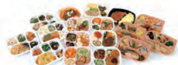
たんぱく質調整食品・エネルギー調整食品 Low-protein foods, low-calorie foods